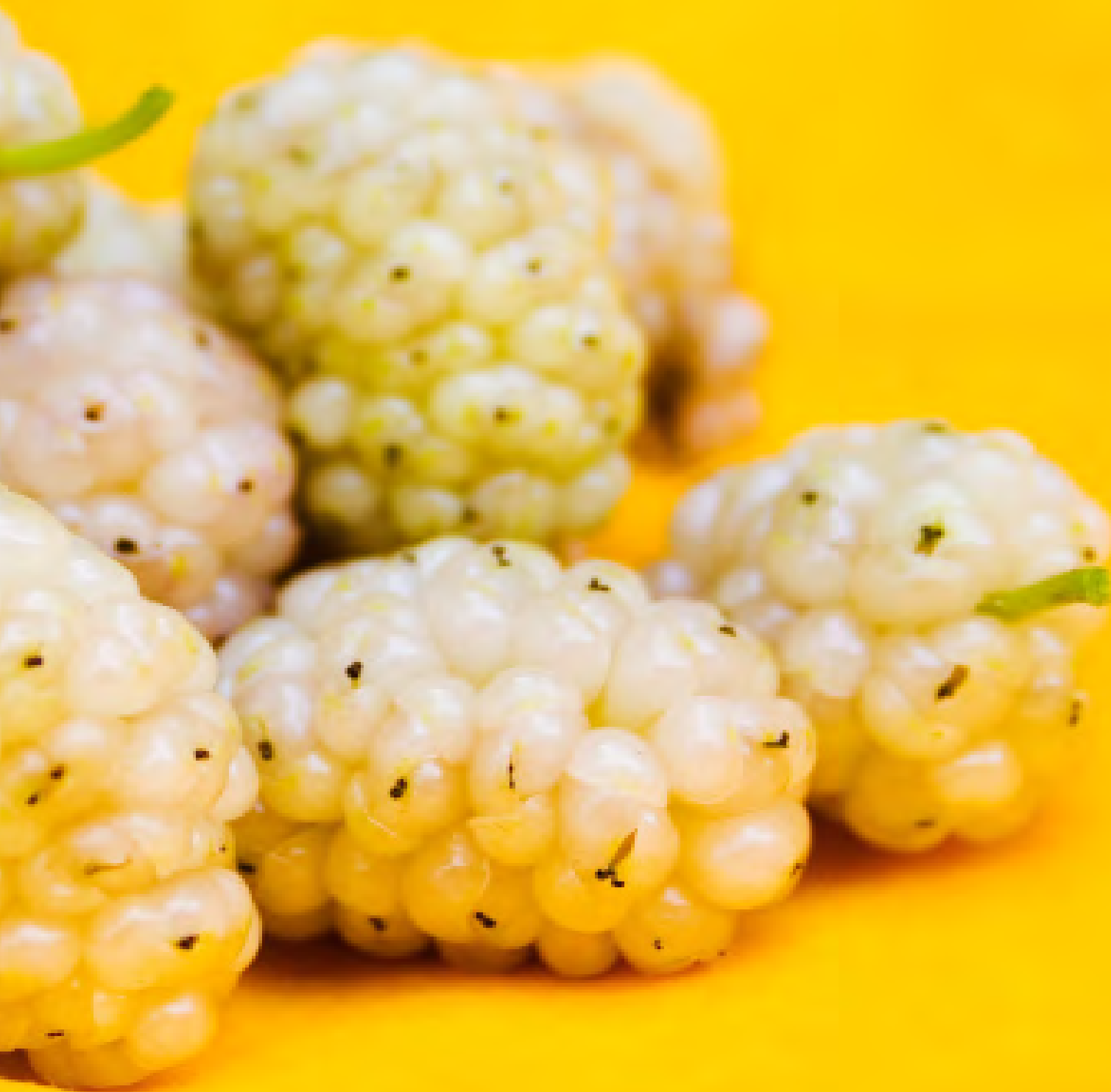
WHITE MULBERRY (Morus alba)