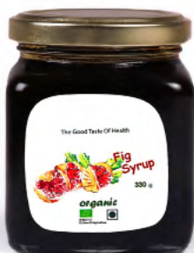
Fig Syrup (Juice)

Fig tree with the scientific name of Ficus carica is used both as an ornamental tree and for the production of fig fruit. The main growing location for this species is West Asia and the Middle East.